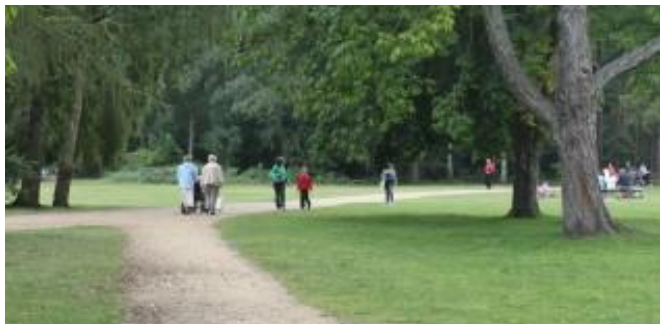
Start of walk towards play area