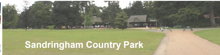
Sandringham Country Park