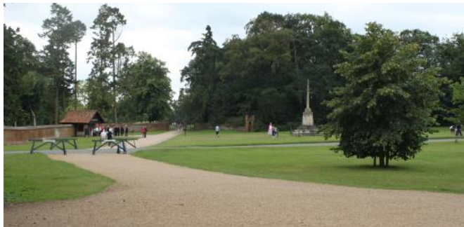
Area around Sandringham visitor area