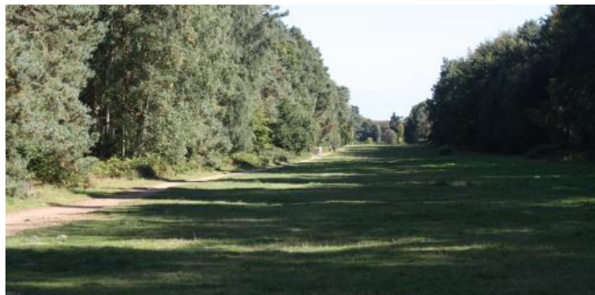
Path towards visitor area on extended walk