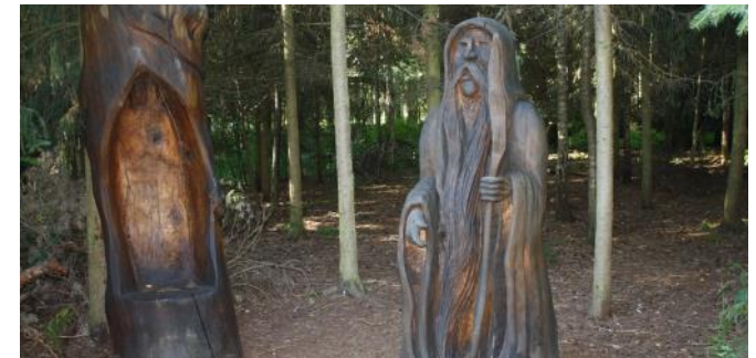
Woodcarvings on sculpture trail