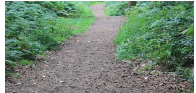
Section of Blue nature trail