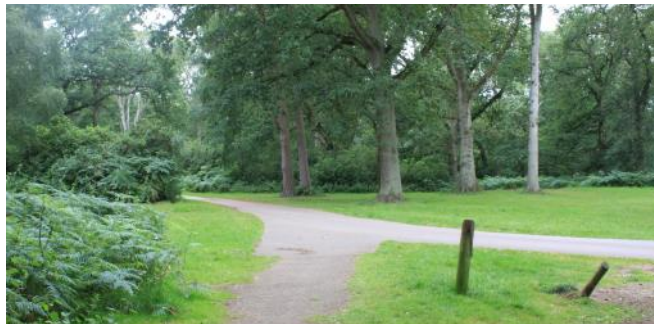
Easy access route as it meets the Scenic drive