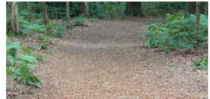
Section of Blue nature trail in woods