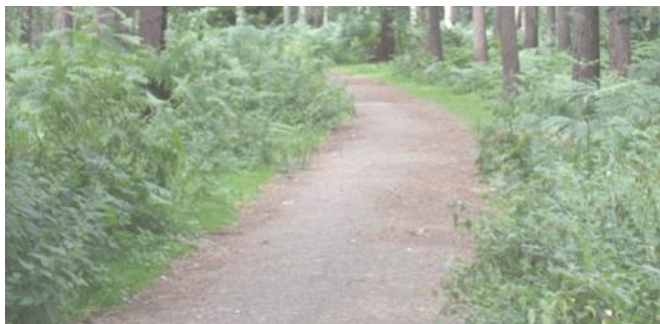
Easy access path